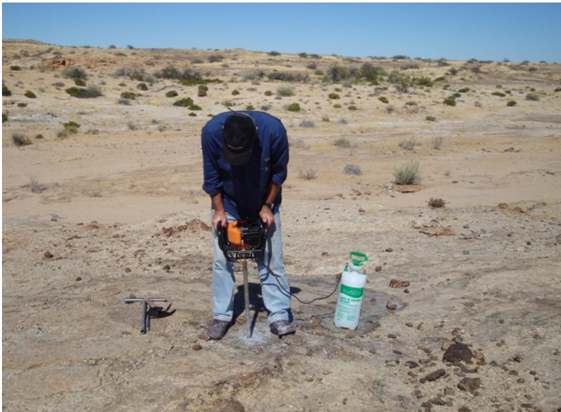
Figure 2 . Portable Core rig being used to collect rock samples